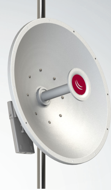
MTAD-5G-30D3 (With standard type mount)