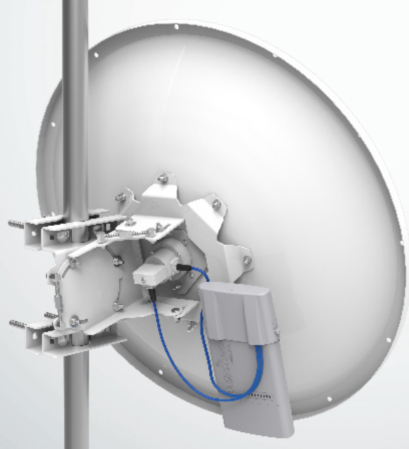
MTAD-5G-30D3-PA (With precision alignment mount)

Note: Basebox radio not included, available separately.