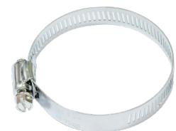
A hose clamp included